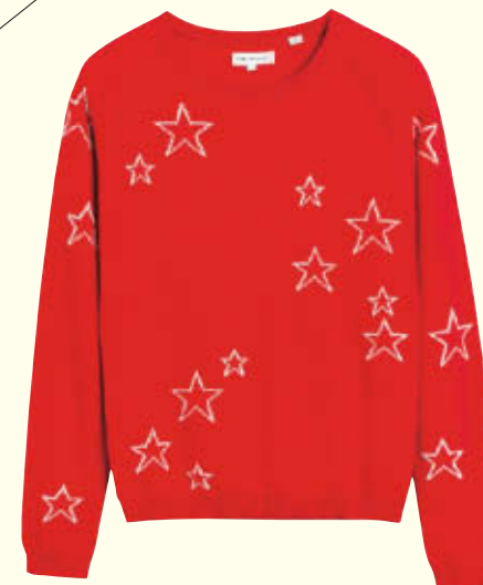
Stars of wonder. Cashmere jumper, £350, Chinti & Parker (chintiandparker.com)