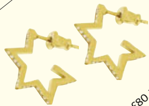
Stellar Earrings, £80, Tada & Toy (tadaandtoy.com)