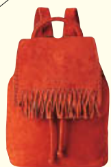
Rucking around the Christmas tree. Rucksack, £116, Liebeskind (amazon.co.uk)