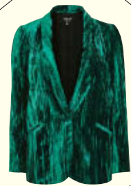
Plush Velvet jacket, £65, Topshop (topshop.com)