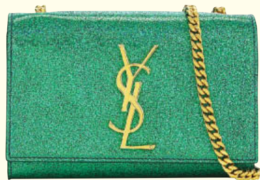
Santa: we've been really, really, REALLY good this year... Leather bag, £1,110, Saint Laurent (selfridges.com)

The family trip to the flicks is as much a part of Christmas as having to pull 'oh, it's great' gift faces. And here to keep everyone (genuinely) happy this year is animated film Ballerina , following orphan Félice (Elle Fanning) as she jetés her way over all obstacles to attend a grand Paris dance school. Sweet and uplifting, your sugar-plum fairies will love. Out tomorrow