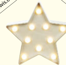
Follow that star! Light, £5.99, New Look (newlook.com)