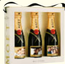
Personalised with your own photos: snappy Champagne, £59.99, Moët & Chandon x Selfridges (uk.moët.com)