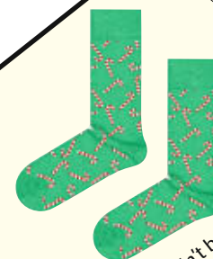
It just wouldn't be Christmas without... Socks, £16 for set of three, Happy Socks (johnlewis.com)