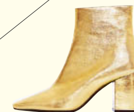
Now all we need is frankincense and myrrh. Boots, £370, Anine Bing (aninebing.com)