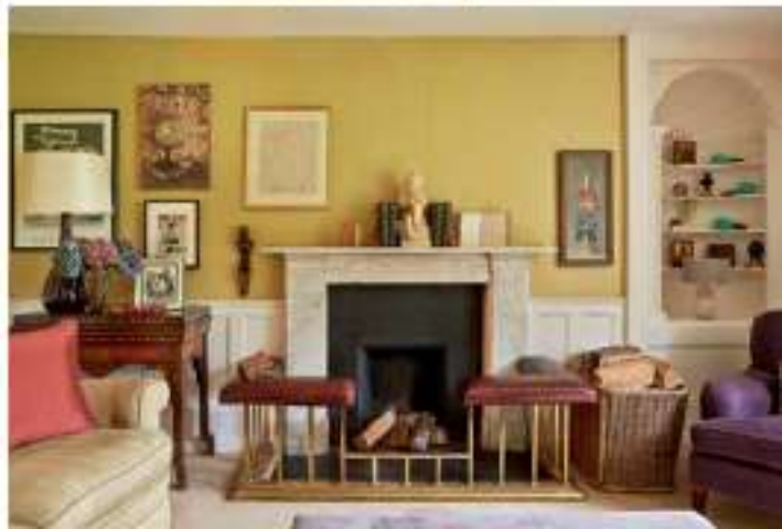
BELOW Golden walls create a rich backdrop for multicoloured details. Interior design by Yodhunter Earle