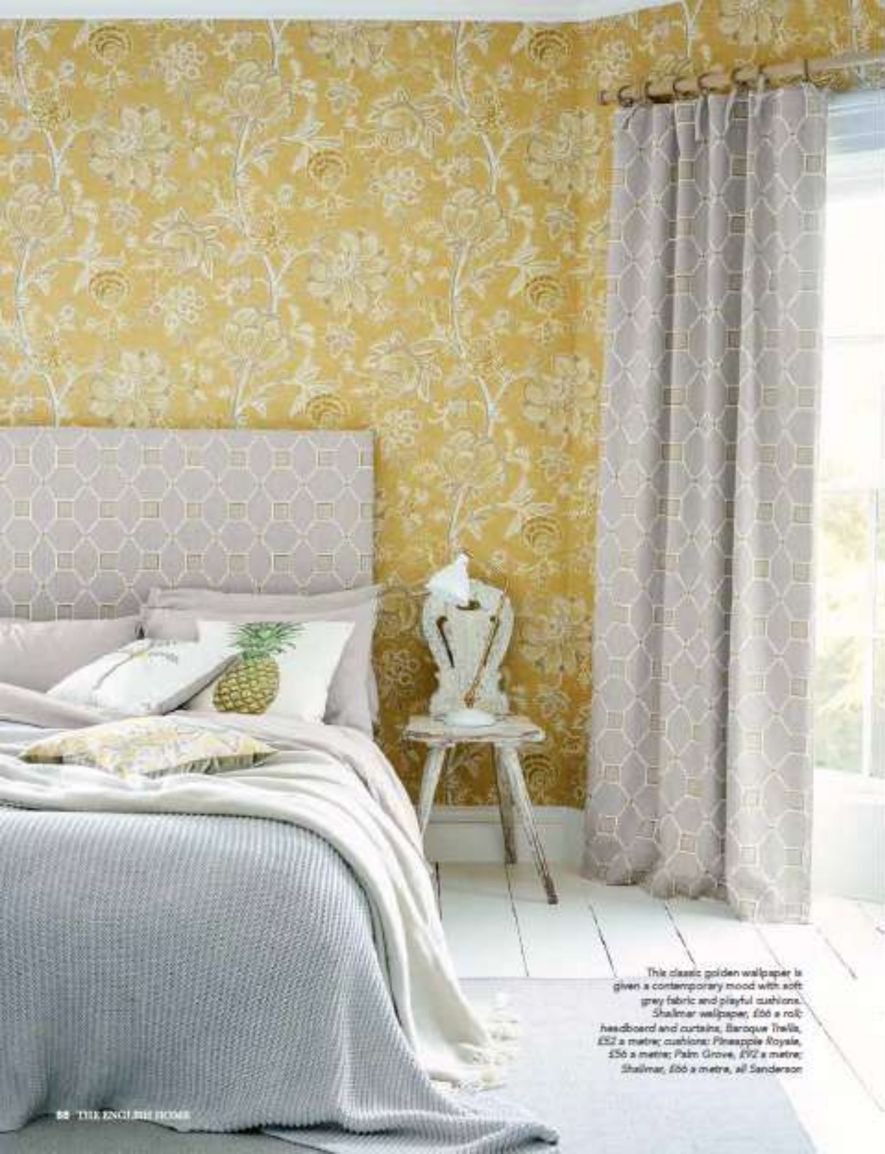
The classic golden wallpaper is given a contemporary mood with soft grey fabric and playful cushions. Shalimar wallpaper, £66 a roll; headboard and curtains, Baroque Trellis, £52 a metre; cushions: Pineapple Royale, £56 a metre; Palm Grove, £92 a metre; Shalimar, £66 a metre, all Sanderson