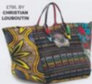
£795, BY CHRISTIAN LOUBOUTIN

The Face Place's signature treatment is an LA favourite: expert extraction followed by zinc and vitamin C being worked deeply into the skin using galvanic current. £140 at the Sense Spa ( rosewoodhotels.com ).