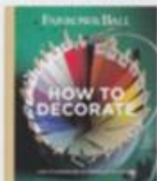
£30