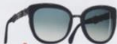
£95, BY CHANEL

2 BEACH CAFE IS YOUR ONE-STOP SHOP FOR EVERY HOLIDAY LOOK. IMAGINABLE, STARTING WITH THIS BLACK AND WHITE COTTON DRESS BY DODO BAR OR . MAJOR RESULT. BEACHCAFE.COM