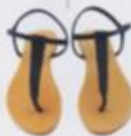
£90, BY A PIEDI

2 BEACH CAFE IS YOUR ONE-STOP SHOP FOR EVERY HOLIDAY LOOK. IMAGINABLE, STARTING WITH THIS BLACK AND WHITE COTTON DRESS BY DODO BAR OR . MAJOR RESULT. BEACHCAFE.COM