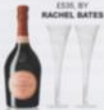
£335, BY RACHEL BATES

The Face Place's signature treatment is an LA favourite: expert extraction followed by zinc and vitamin C being worked deeply into the skin using galvanic current. £140 at the Sense Spa ( rosewoodhotels.com ).