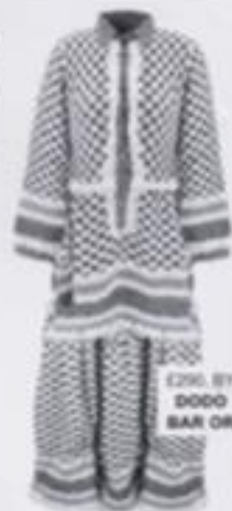
£290, BY DODO BAR OR

WE'RE BESOTTED WITH A PIEDI . THEIR SHOES – THESE NAVY SLIDE AMY SANDALS, FOR INSTANCE – LOOK WAY MORE EXPENSIVE THAN THEY ACTUALLY ARE. IMMENSELY GLAMOROUS AND, CRUCIALLY, WILDLY COMFORTABLE. APIEDI.CO.UK